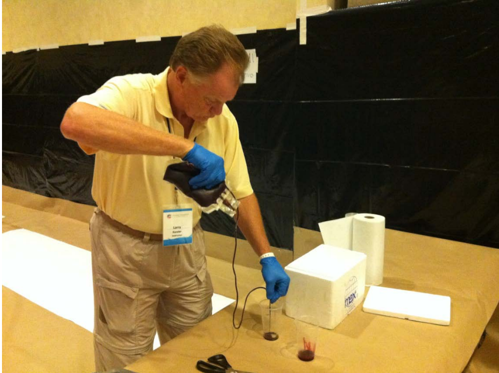
BPA Instructor – Nuevo Vallarta, Nayarit