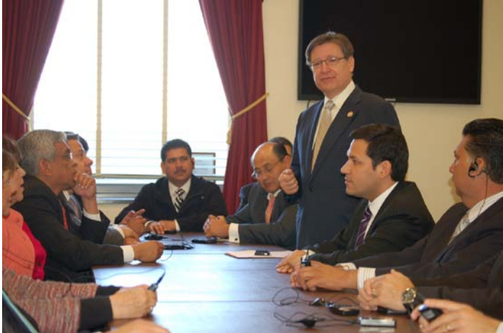
Congressman Francisco "Quico" Canseco addressing BLC delegation.