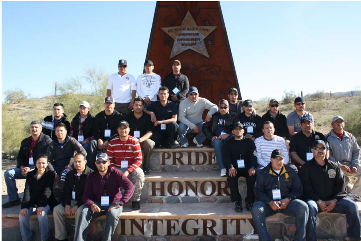
Investigators at Phoenix Training - January 24-26, 2011

Thirty (30) investigators from the Attorney General Offices of the states of Baja California, Chihuahua, and Sinaloa participated in a training course in Phoenix, Arizona from January 24 through January 26. Training subjects included advance investigative techniques such as negotiating, building entry, down officer rescues, and high risk vehicle stops led by various detectives from the Phoenix Police Department.