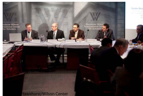
Bordre Research Partnership Addressing BLC members