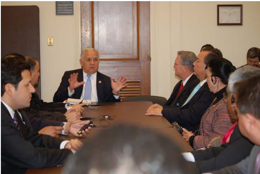
Congressman Silvestre Reyes, Co-Chair of the Congressional Border Caucus, briefing BLC members.