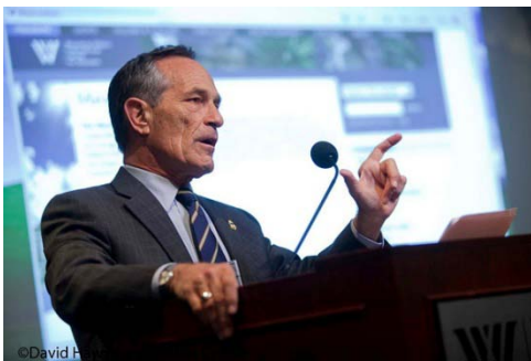
CBP Commissioner Alan Bersin