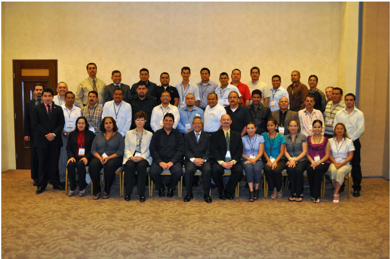
Forensic Scientists in Nuevo Vallarta, Nayarit– March 27-April 1