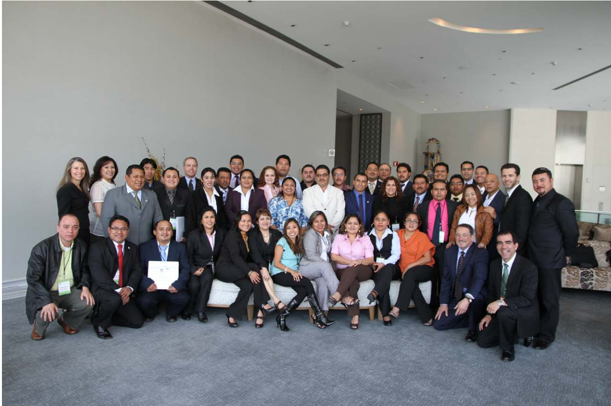
Prosecutors from AGOs in Campeche, Chiapas, Oaxaca and Tabasco in Mexico City– March 14-18