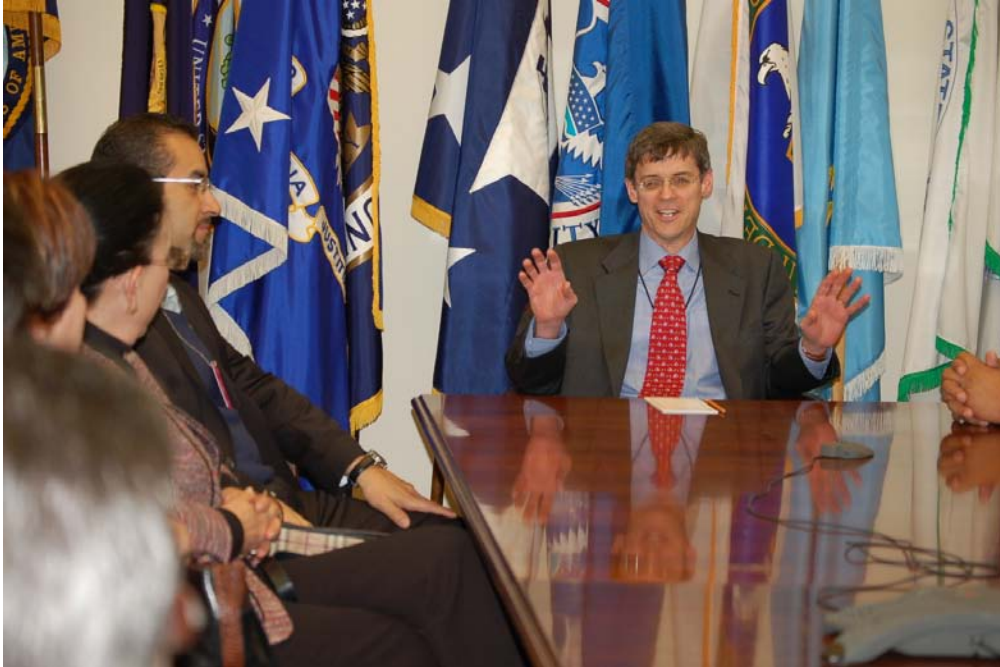
Kevin O'Reilly, Director of North American Affairs at the U.S. National Security Council, briefs BLC delegates during their visit to the White House Office of Intergovernmental Affairs.