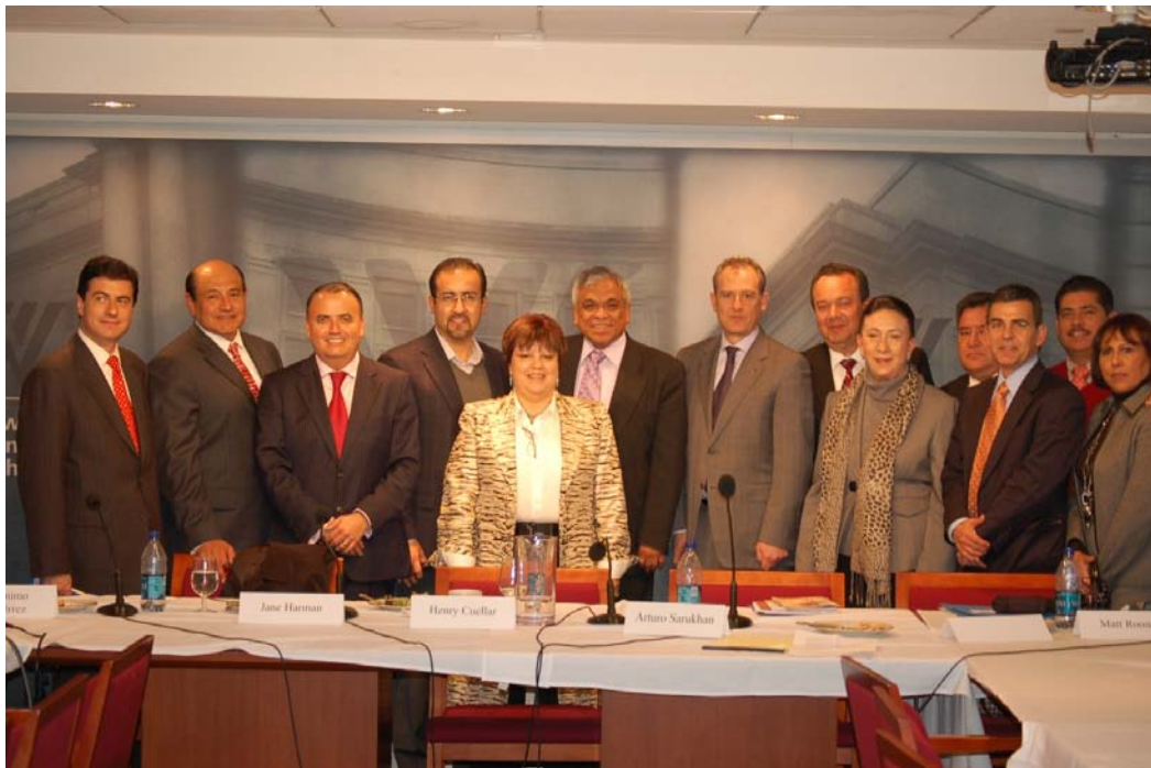
BLC Group Picture with Mexico's Ambassador Arturo Sarukhan at Woodrow Wilson International Center for Scholars – Mexico Institute.