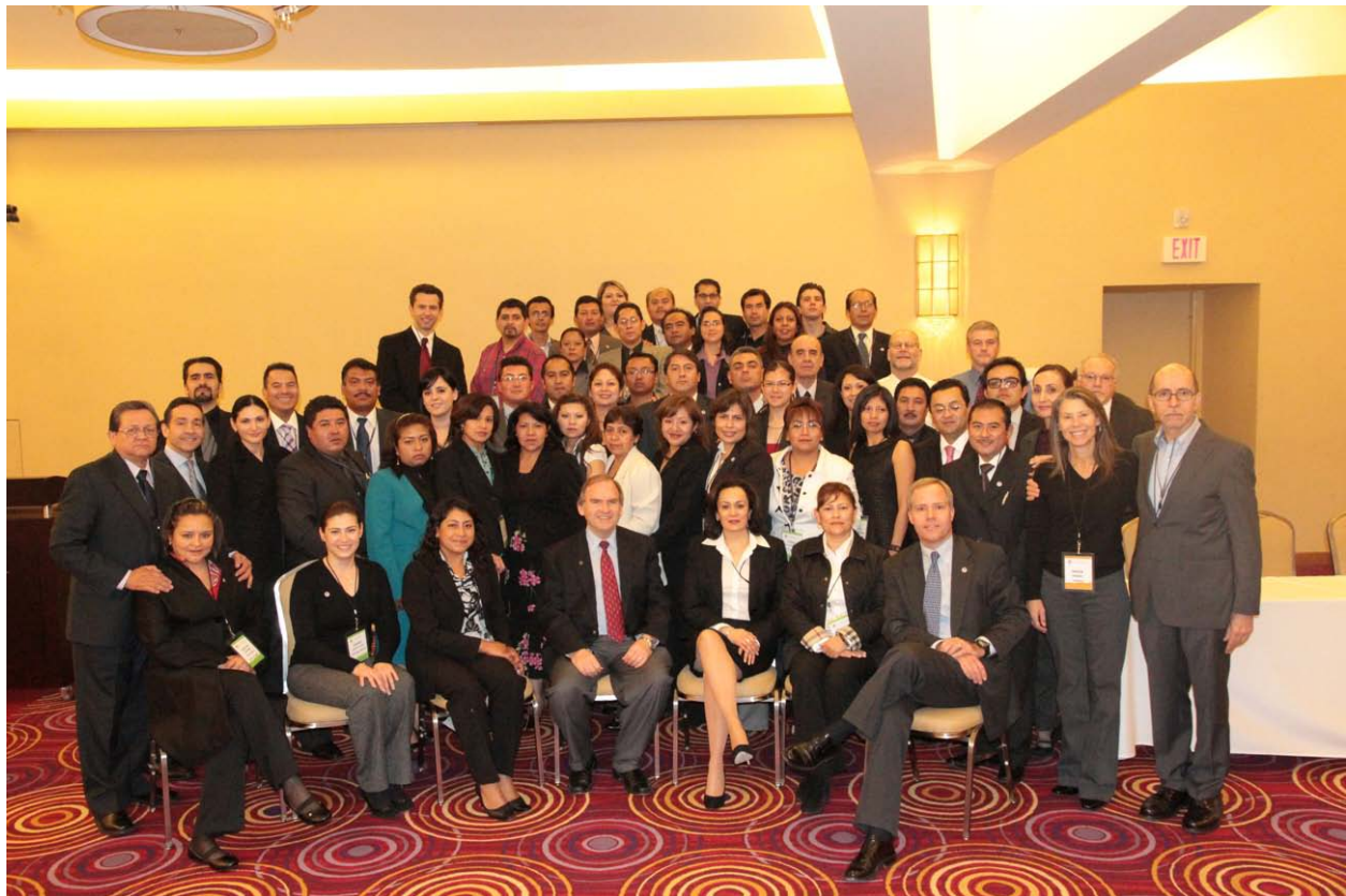
Prosecutors from AGOs in Distrito Federal, Hidalgo, Puebla, Tlaxcala, and Baja California in Mexico City– January 31-February 4

The Alliance Partnership’s (AP) first in-country course of the year was held in Mexico City January 31 – February 4, 2011. With logistical support from Mexico’s Federal Attorney General’s Office (PGR) and Mexico City’s AGO (PGJE D.F.) for transportation, the oral trial training was presented to 42 prosecutors from five Mexican states. Additionally, USAID-Mexico local university partners were invited to attend as observers and the Universidad Nacional Autónoma de México (UNAM) was represented by four observers while Instituto Tecnológico Autónomo de México (ITAM) was represented by three observers.